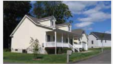
Loveland Hills, Hebron, CT