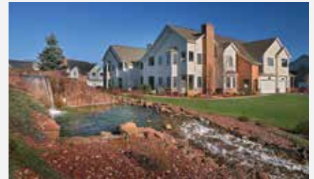
The Mansions, Vernon, CT