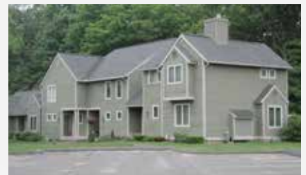
Piper Brook, Condominiums, Newington, CT