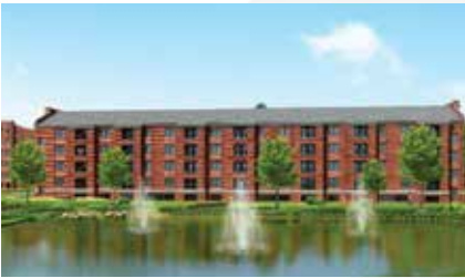
Mechanic Street Apartment, Windsor, CT