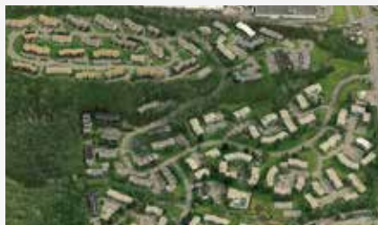
Cromwell Hills, Cromwell, CT