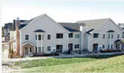
Autumn Chase Apartments, Ellington, CT