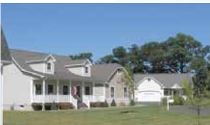
Village at Hunt Glen, Granby, CT