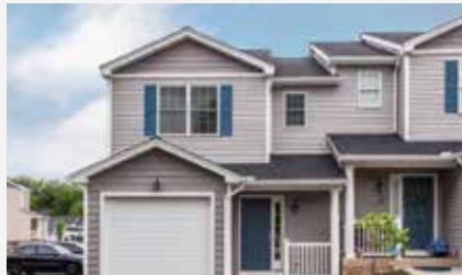
Miller Farms Condominiums, Manchester, CT