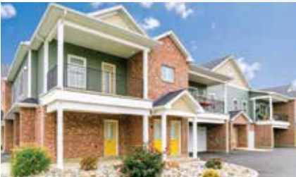
Mayfield Place, Enfield, CT