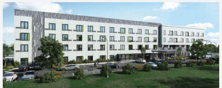
COURTYARD BY MARRIOTT, W. Springfield, MA