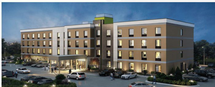
HOME2 SUITES, Newington, NH