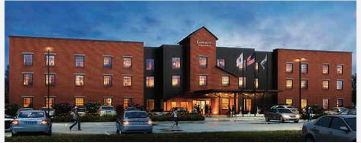
FAIRFIELD INN & SUITES, Williamstown, MA