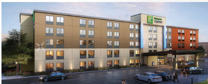
HOLIDAY INN EXPRESS, Chelmsford, MA