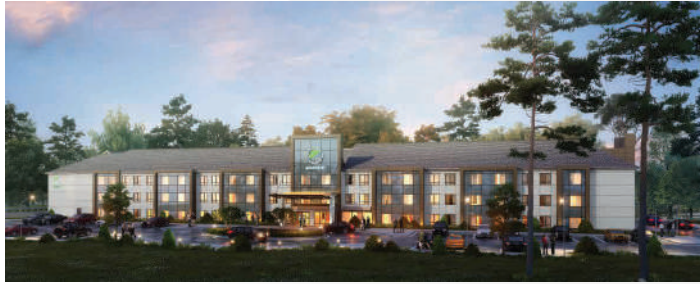
ELEMENT HOTEL, Chelmsford, MA