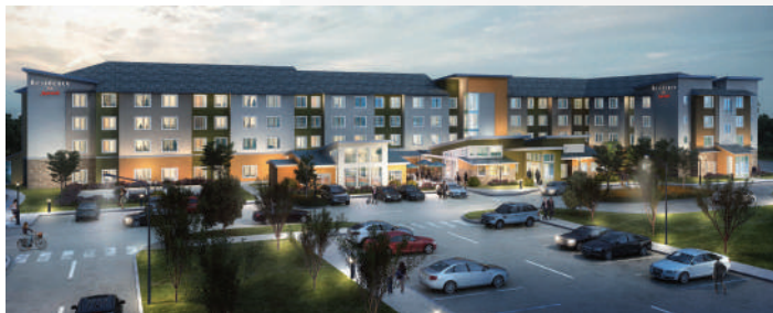
RESIDENCE INN, Hamden, CT