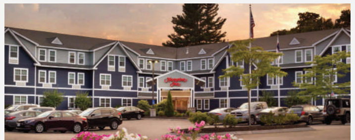
HAMPTON INN, Dover, NH