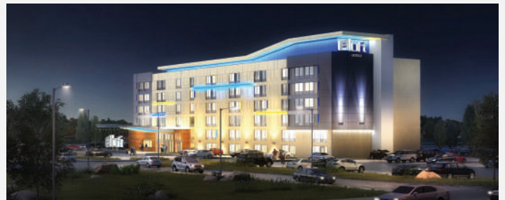
ALOFT HOTEL, Framingham, MA